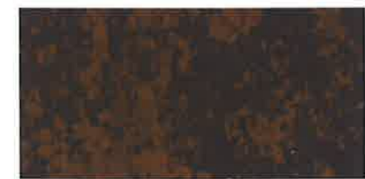
COR-TEN AZP RAW

* ADDITIONAL COST WILL APPLY FOR DEEP TONE COLORS.